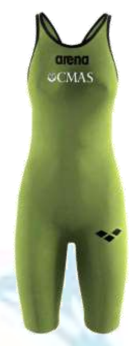
- Carbon PRO Closed back- Carbon PRO Open back