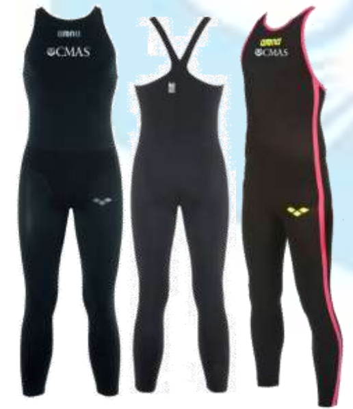
Evo + for\ Man