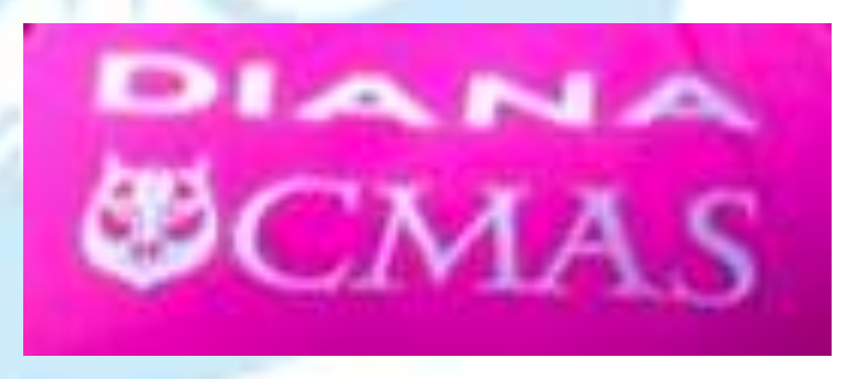
Textile swimsuit DIANA CMAS M1 STORM.NEXT