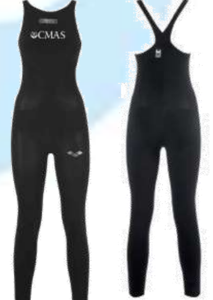
Evo + for Woman